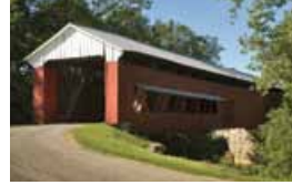
Scipio Covered Bridge Jennings County

Directions: Take SR 7 just north of Scipio, turn east on N CR 575 W, bridge crosses Sand Creek Coordinates: N 39.08450 W 85.72033 39°05'04" N, 85°43'13" W Open to traffic