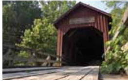
Bean Blossom Covered Bridge Brown County

Directions: Just south of SR 135 intersection with SR 45 in Bean Blossom, turn west on Covered Bridge Rd., bridge crosses Bean Blossom Creek Coordinates: N 39.26100, W 86.25533 39°15'40" N, 86°15'19" W Open to traffic