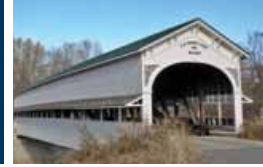
Westport Covered Bridge Decatur County

Directions: Take E Main St. east out of Westport, becomes W CR 1100 S, turn east on W. Layton Dr., bridge crosses Sand Creek Coordinates: N 39.16685, W 85.54628 39°10'01" N, 85°32'47" W Open to traffic