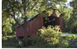
James Covered Bridge Jennings County

Directions: Take SR 3 south of Lovett, turn east on W CR 650 S, bridge crosses Graham Creek on CR 625 S Coordinates: N 38.89300 W 85.61567 38°53'35" N, 85°36'56" W Open to traffic