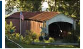
Shieldstown Covered Bridge Jackson County

Directions: US Hwy 50 East of Brownstown, turn north onto E CR 200 N to Shieldstown, bridge crosses East Fork of the White River Coordinates: N 38.91533, W 86.00283 38°54'55" N, 86°00'10" W Open to pedestrians only