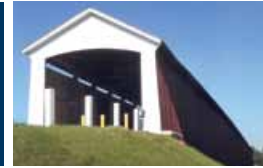
Medora Covered Bridge Jackson County

Directions: SR 235 east of Medora, turn north onto road leading to covered bridge (runs parallel to new highway and bridge), which crosses East Fork of the White River Coordinates: N 38.81905, W 86.14765 38°49'09" N, 86°08'52" W Open to pedestrians only