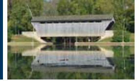
New Brownsville Covered Bridge Bartholomew County

Directions: In Mill Race Park, Columbus. Park Entrance at 5th St. and Lindsey St., bridge crosses branch of Driftwood River Coordinates: N 39.20611, W 85.92917 39°12'22" N, 85°55'45" W Open to traffic