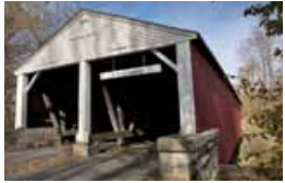
Ramp Creek Covered Bridge Brown County

Directions: Take SR 46 East of Nashville, bridge is located at the North Gate Entrance to Brown County State Park and crosses Salt Creek Coordinates: N 39.19533, W 86.21650 39°11'43" N, 86°12'59" W Open to traffic