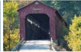
Williams Covered Bridge Lawrence County

Directions: SR 450 west of Williams, turn south on Huron-Williams Road. Bridge crosses East Fork of the White River Coordinates: N 38.79700, W 86.66483 38°47'49" N, 86°39'53" W Open to pedestrians only