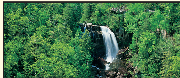
Whitewater Falls plunges over the Blue Ridge Escarpment.

Under the present fee program, up to 80 percent of the collections may fund improvements at this site. These improvements can range from trail construction to restroom renovation.